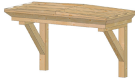
Flat Side Drip