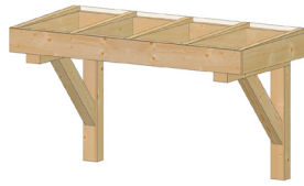
Flat Front Drip