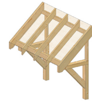
Lean to Open