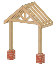
Gable Front Posted