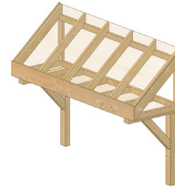
Lean to Closed