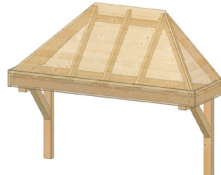
Hipped Open End